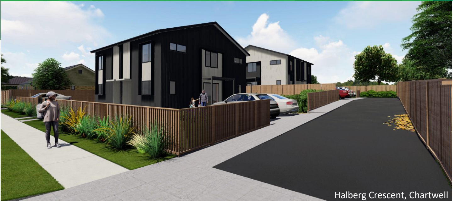
Halberg Crescent, Chartwell